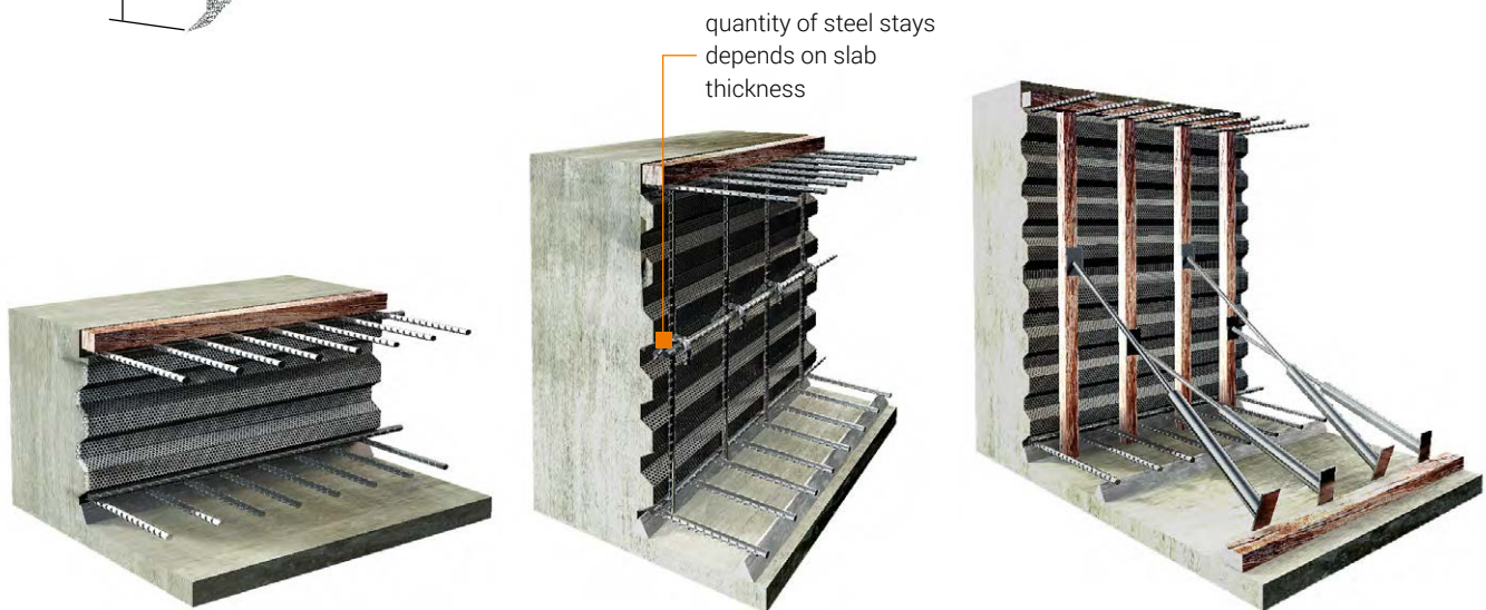
H < 30 cm

Formax 1000 installation between upper and bottom reinforcement of RC slab.