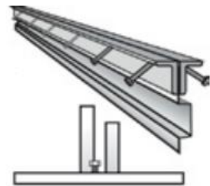
RECOSTAL® Keyboard XLW